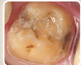
1 WEEK POST-OP